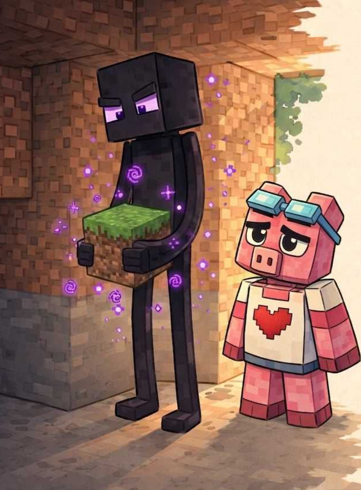
Fig Pig and his friend followed the dark thing and found it again. It held a block with such care, not like a robber, but like a kid with something common but loved. 'Oh,' Fig Pig whispered. 'They do not want to steal. They want to make things with blocks, the same as us. Perhaps no one ever lets them join in.'