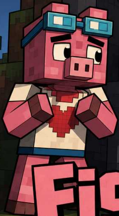
Fig Pig and the Dark Cave