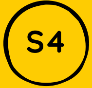
Fig Pig and the Dark Cave

When a tall, purple-eyed Enderman appears at Fig Pig's window in the dead of night, he can't stop wondering: why is it so angry? Why do Endermen steal blocks, and where do they take them? With his friend Player at his side, Fig Pig tiptoes into a shadowy cave to uncover the truth behind the screams - but what will he find lurking in the dark? This decodable reader practices VC/CV syllables in words like 'common,' 'hidden,' 'follow,' and 'sudden.'