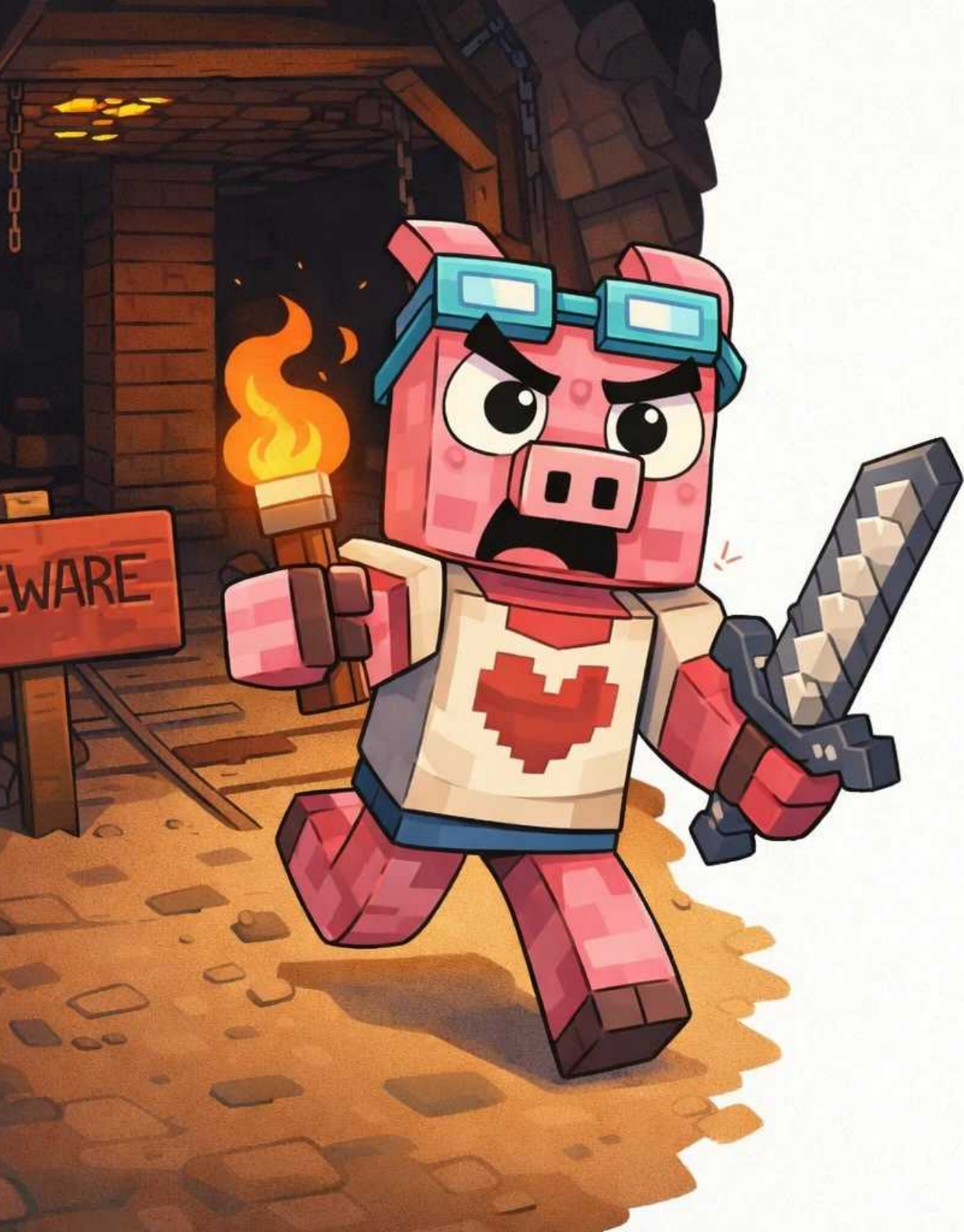
Fig Pig found no coal, just a sword and a dream.

Then he read the sign, squealed loud, and ran off with a scream.