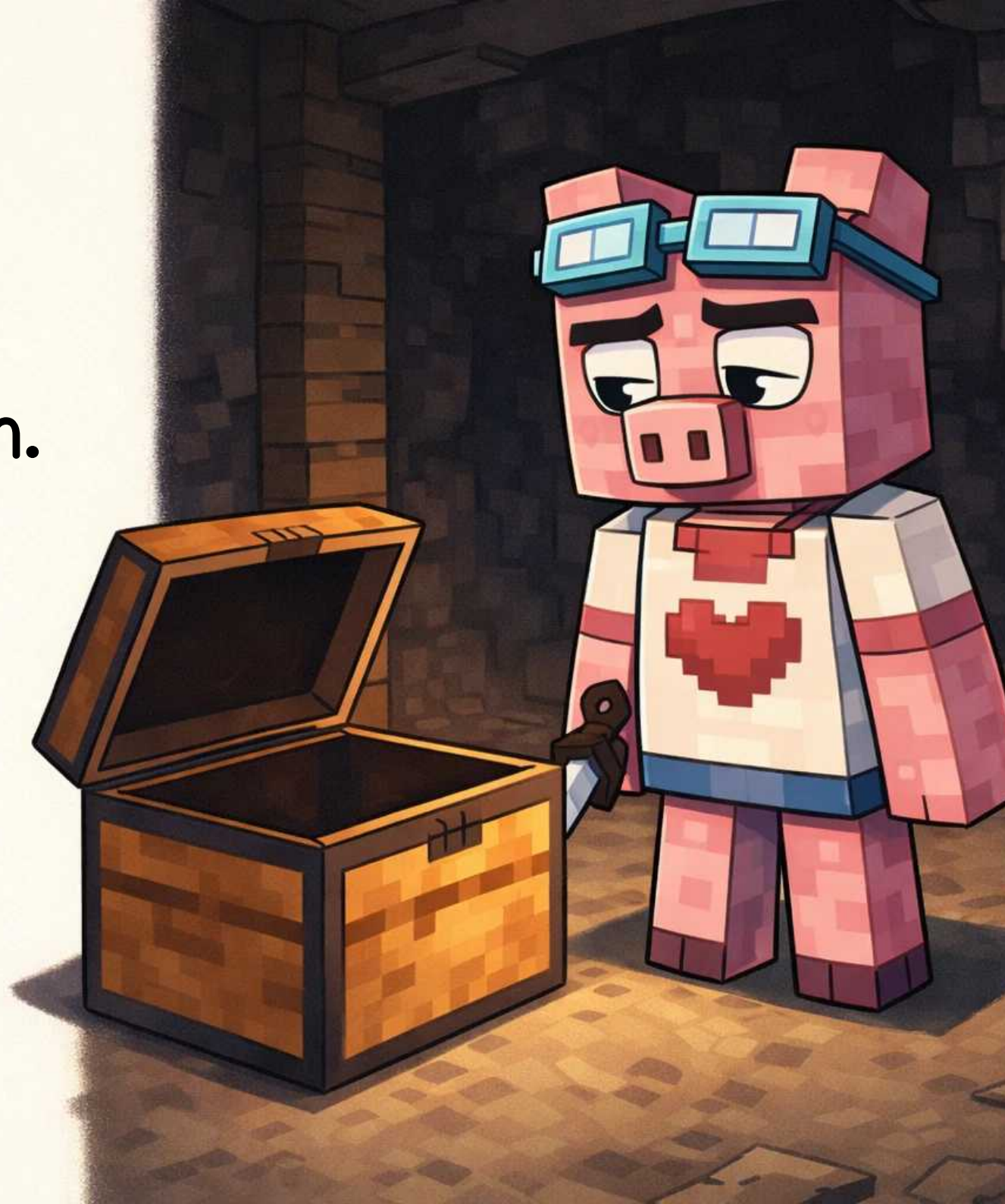
Fig Pig spied a chest with a bright gold gleam. He gripped the sword and said, 'This is like a dream.'